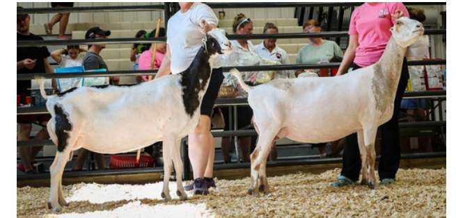
GCH Here Be Goats SFC Marley 6*M EX 91 EEEE and her two-year-old daughter, GCH (pending) Here Be Goats HMN

When trying to feed and manage your herd, hay is the foundation! If you do not feed top quality legume-based hay, you will not have goats that perform. Grain is never a substitute for great hay. Also, when trying to learn AI, be patient! Don't breed too soon, if they are flagging 12 hours later, use a 2nd straw rather than wasting a heat cycle.