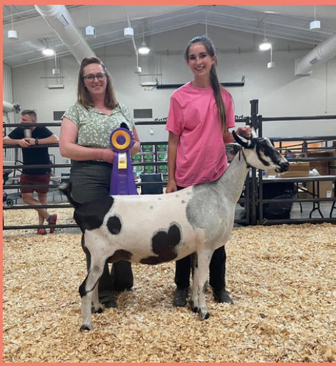
Noble-Springs Kensington Mae